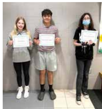
High School students of the month for March