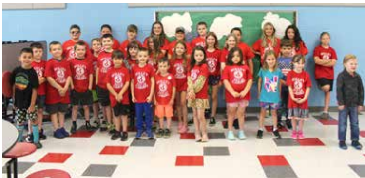
Elementary students of the month for May