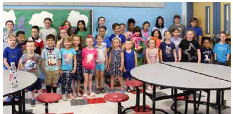
Elementary students of the month for April