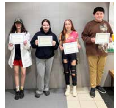
High School students of the month for April